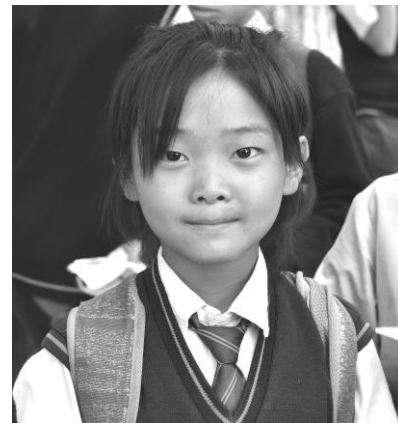
A young student at the Foundation